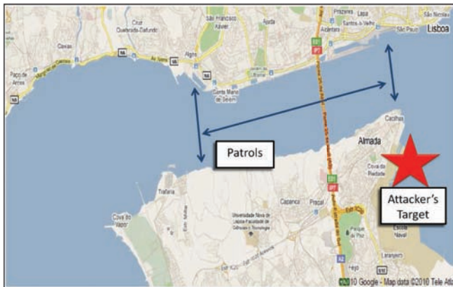
Figure 2: Patrol Locations and Attacker’s Target