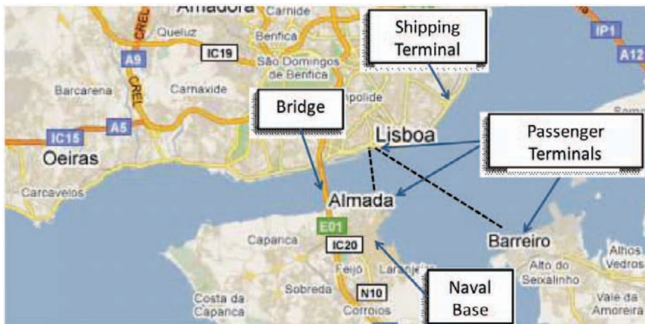
Figure 1: Port of Lisbon

A busy section of the Tagus River at Lisbon, of approximately 10 by 5 km, was modelled (see Figure 1). Initial