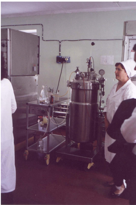
Figure 6. Visit to the Institute of Pharmaceutical Biotechnology to which some of the equipment from the BW production facility. Fermentor at the institute

The scientific presentations were of varying quality and focus. However, several CIS (Commonwealth of Independent States) scientists, prominent in their fields, presented research that could be of interest to western scientists. It should be noted that due to a programme change, most if not all western conference participants and some Russians were given a tour of the environmental analysis laboratory and the Institute of Pharmaceutical Biotechnology, during the scientific session on Wednesday afternoon.