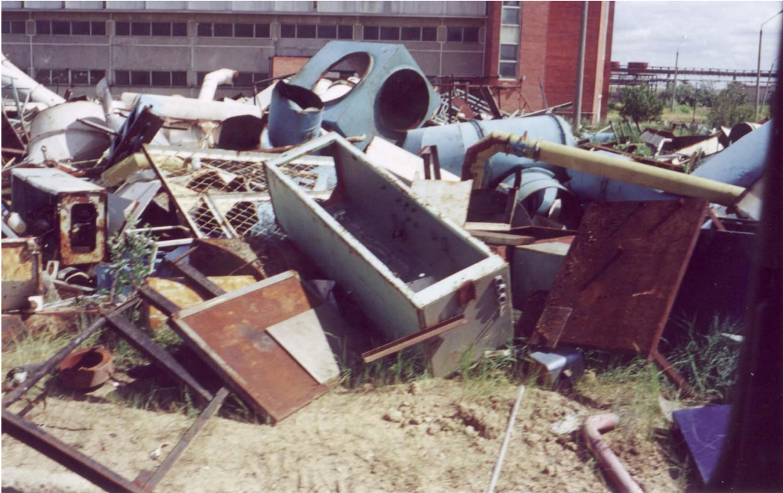
Figure 5. Scraps of metal and equipment was dumped outside the buildings

According to A. Weber, the facility cost about 1 billion Rubles to build (although prison labour was used), and he views it as a wholly misplaced investment by the Soviet Union.