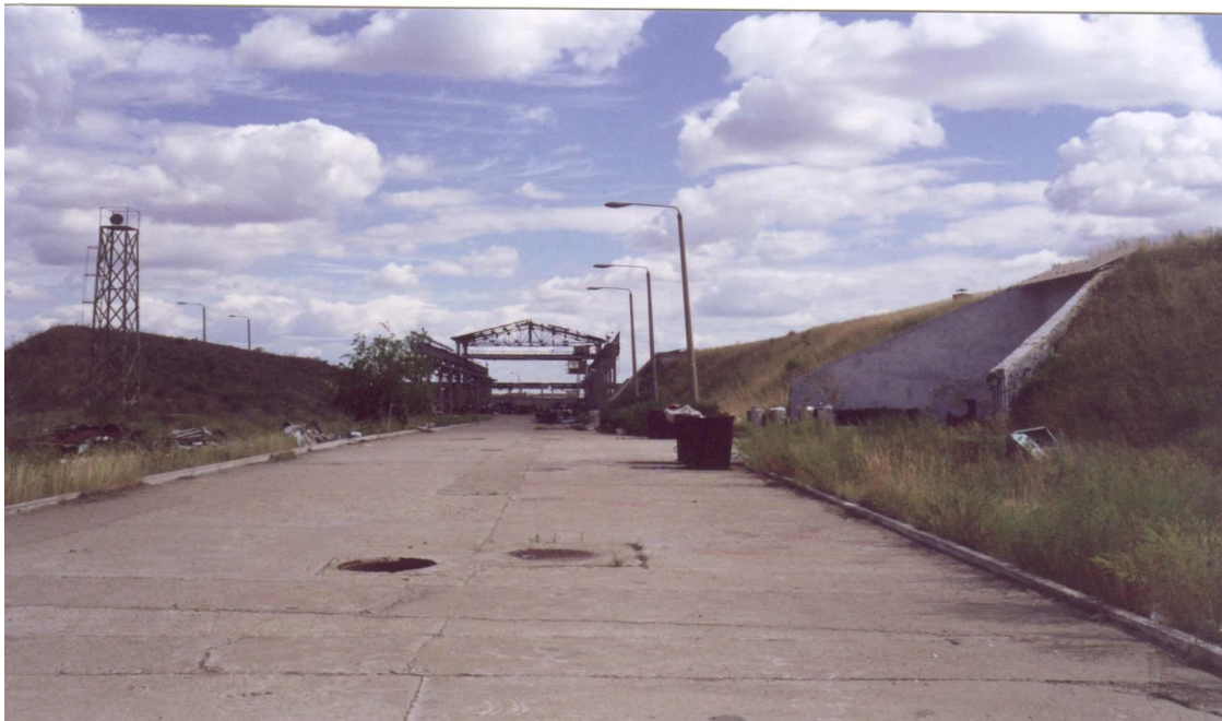
Figure 4. Loading area for BW ammunition

During the visit to the bunker the weaponization was described more in detail. Loading the bomblets (or the like) with explosive was dangerous work. To avoid a blast that would set off all ammunition, loading the explosive was done individually for each piece of BW ammunition and in a separate room to contain any explosion. In the bunker, there was a small cubicle (each wall 2-2,5 m and high enough for a man to stand straight inside), perhaps a mobile unit, all the inside clad with metal sheeting. Inside it was a work bench (ca 2 m long) along one wall of the cubicle and a gas tube (ca 1,5 m tall) standing at the wall opposite the door. It is possible that this could be the type of “room” used for loading the explosive charges.