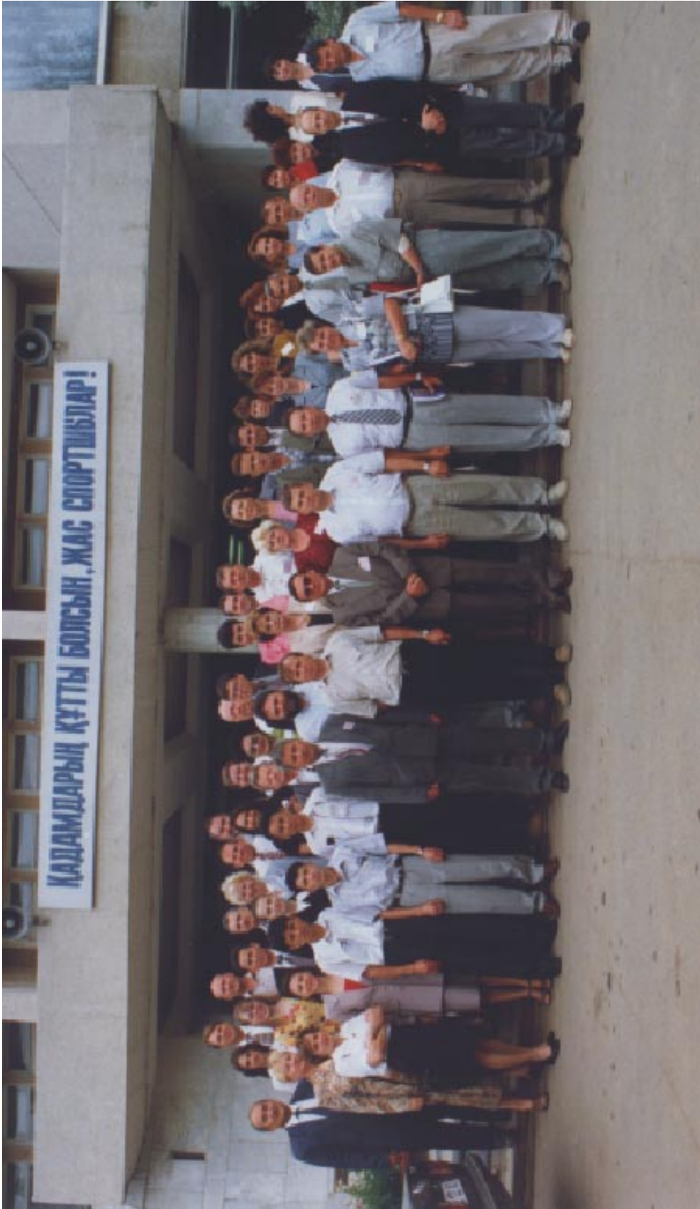
Figure 7. Photograph of participants outside conference building