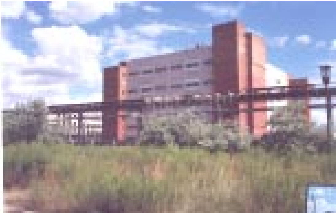
Figure 1. View of the facility (all photos in report by the authors if nothing else is indicated)

The conference offered a good opportunity to meet and discuss with the participants both from the CIS countries and the West. Among the CIS participants there were both scientists, directors of scientific institutes as well as those representing government offices. Also, a journalist from the Washington Post, and a journalist and a photographer from Reuters attended the conference including the tour of the facility.