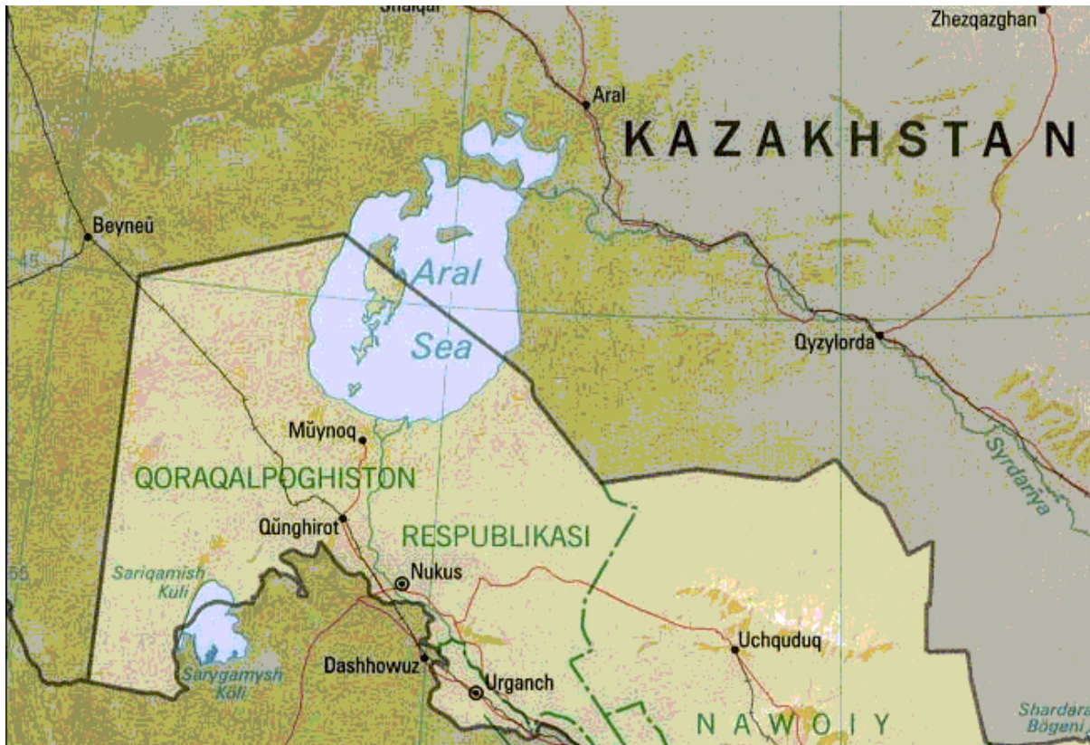
Figure 8. Map of Vozrozhdeniye island situated in the middle of the Aral Sea

There was also resentment over the description of insufficient protection of a collection of microorganisms. However, some improvements and up-grades will be needed although the collection in fact is not untended. It was also mentioned that there were no success stories in the bio-area when it comes to commercialization in the IPP projects so far.