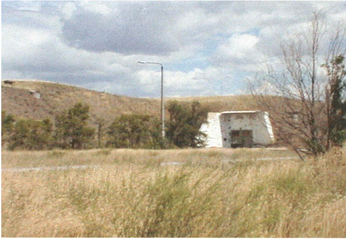
Figure 3. Bunker for storing biological weapons